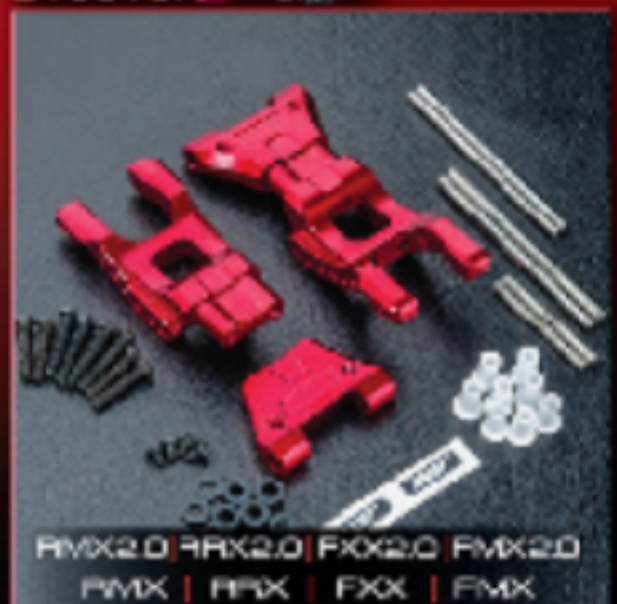
MB Alum. Rear lower arm set (red) MB 鋁合金後下避震架 (紅)