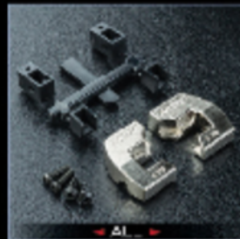
Upright weight 10g 垂直配重片 10g