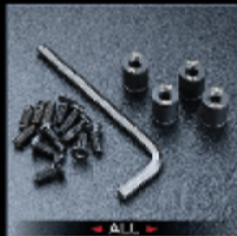
MST Balancing weights 2.5g (4) MST 配重片 2.5g (4)