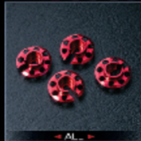
Alum. damper retainer (red) (4) 鋁合金避震器 (紅) (4)