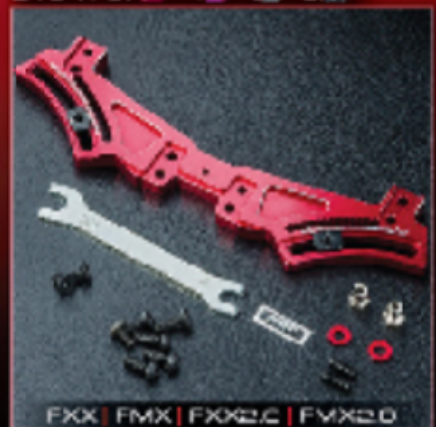
FXK Alum. rear quick adj. damper stay (red) FXK 鋁合金後快調避震器 (紅)