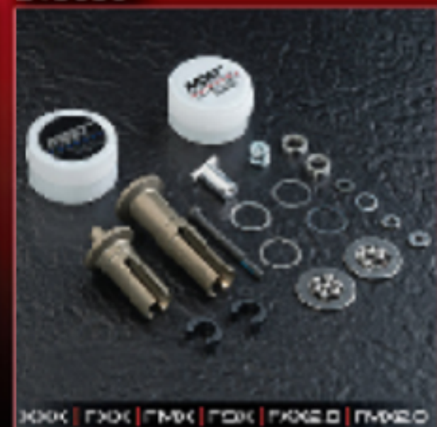
Alum. ball diff. joint set 鋁合金球差速器轉接架