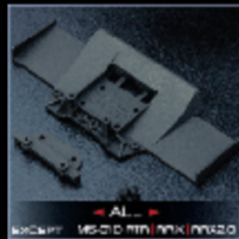
Universal rear balancing diffuser 通用後避震架