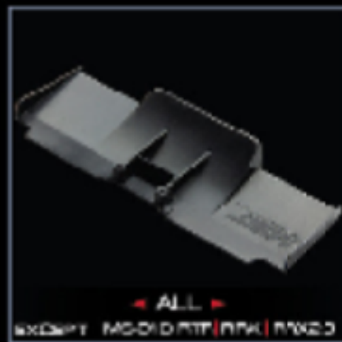
MST Diffuser MST 後避震架