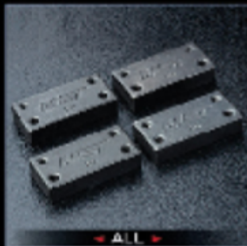
MST Balancing weights 30g (4) MST 配重片 30g (4)