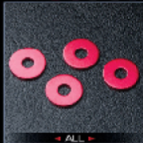
Wheel hub spacer 1.0 (rec) (4) 輪軸墊片 1.0 (紅) (4)