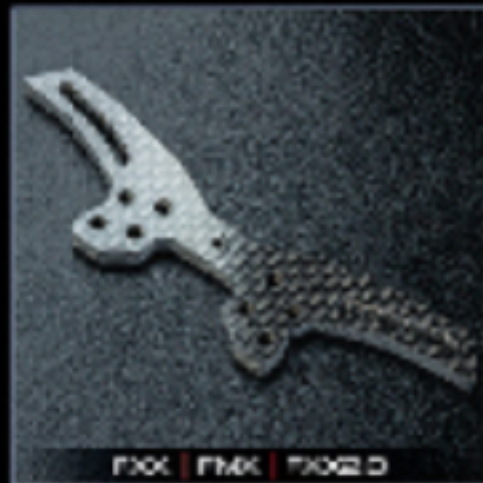
FXK Carbon front damper stay 3.5 FXK 碳纖維前避震器 3.5