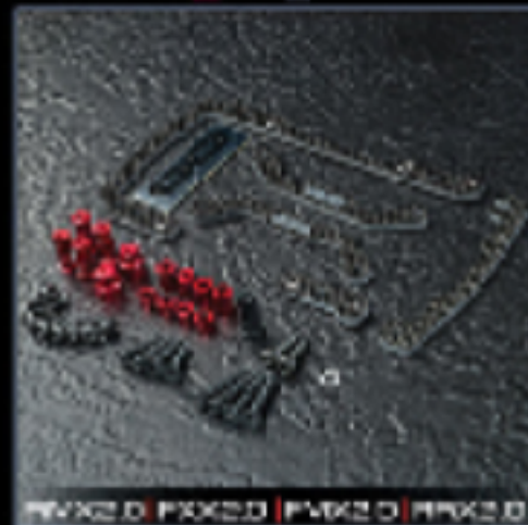
Carbon short battery holder set (red) 碳纖維短電池架 (紅)