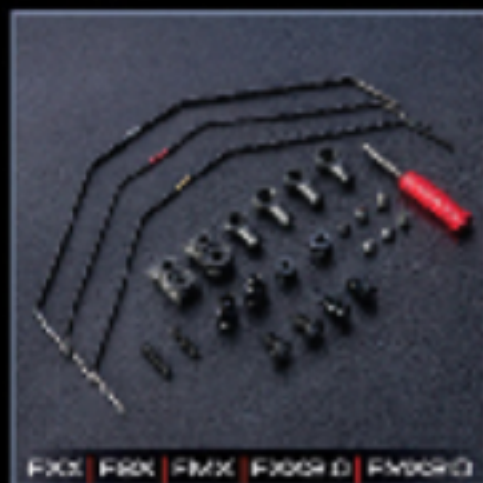
FXK Rear stabilizer set FXK 後防傾器