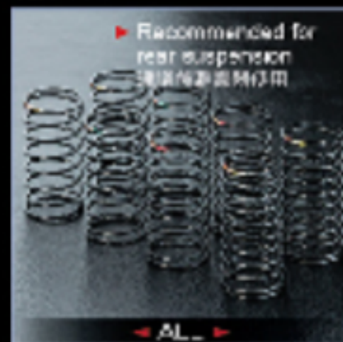
31mm Super-soft coil spring set (8) 31mm 超軟避震彈簧組 (紅)

More details, please refer to MST website. | 更多詳情請到官網上查詢 rc-mst.com