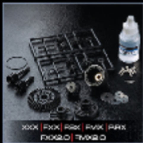
XXX Reinforced bevel cliff assembly XXX 強化凸角避震器