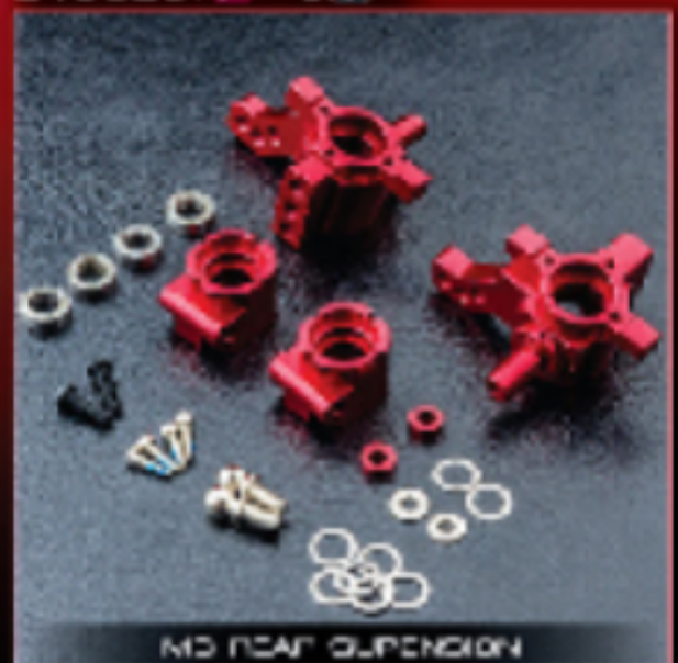
MB Alum. Rear upright set (red) MB 鋁合金後上避震架 (紅)