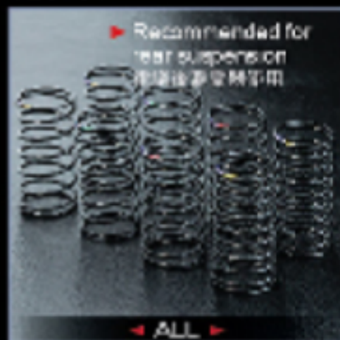
31mm Soft coil spring set (8) 31mm 軟避震彈簧組 (紅)