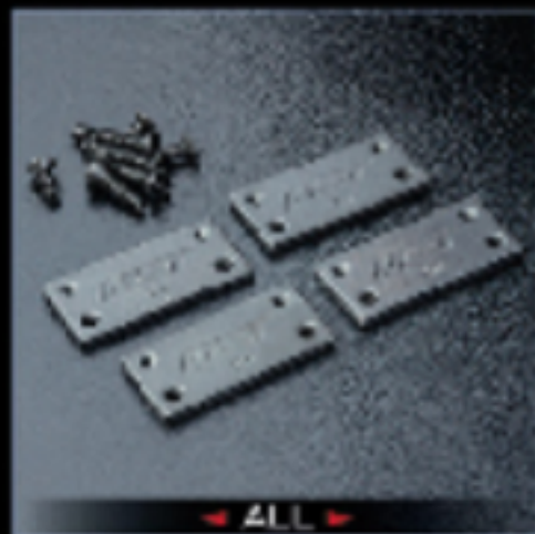
MST Balancing weights 10g (4) MST 配重片 10g (4)