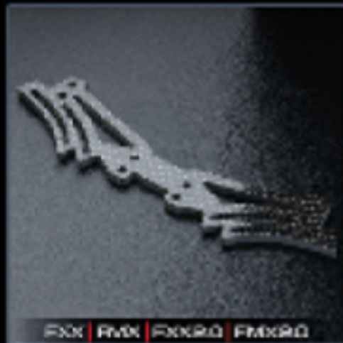
FXK Carbon rear damper stay 3.5 FXK 碳纖維後避震器 3.5