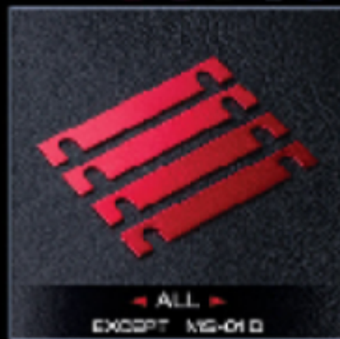
Suspension mount spacer 0.5mm (4) (red) 避震器墊片 0.5mm (4) (紅)