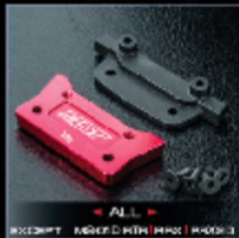
Alum. balancing weights adaptor (red) 鋁合金配重器轉接片 (紅)