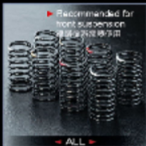
25mm Coil spring set (8) 25mm 避震彈簧組 (紅)