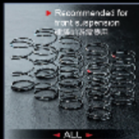
31mm Hard coil spring set (8) 31mm 硬避震彈簧組 (紅)